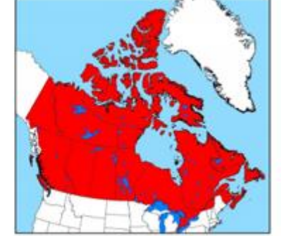
Traditional Levelling Networks