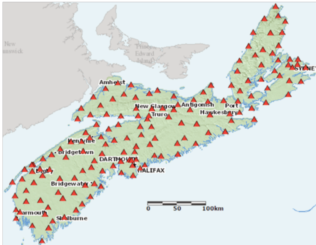
Figure 2: NSHPN reference framework.