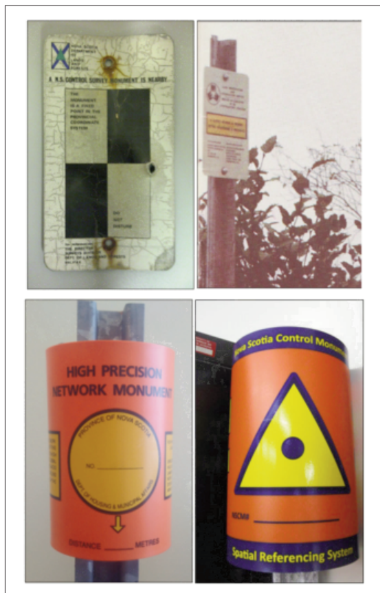
Figure 4: Evolution of the Nova Scotia Control Monument Sign from 1968 to 2015. Top left—circa 1968; top right—circa 1979; bottom left—circa 1996; bottom right—2015.