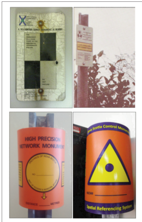
Figure 4: Evolution of the Nova Scotia Control Monument Sign from 1968 to 2015. Top left—circa 1968; top right—circa 1979; bottom left—circa 1996; bottom right—2015.