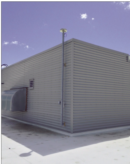
Figure 2: ACS in Halifax, Nova Scotia.

Evolutions in geodetic technologies have changed the way in which geodetic programs are now delivered. Geodetic control monuments, for example, now actively generate data that can be used to determine high accuracy positions in real-time. Presented is a discussion on how geodetic technologies have evolved to become a core infrastructure, not just in surveying and mapping, but in other industries. Example applications are presented and a discussion on future needs for geodetic resources is also provided.