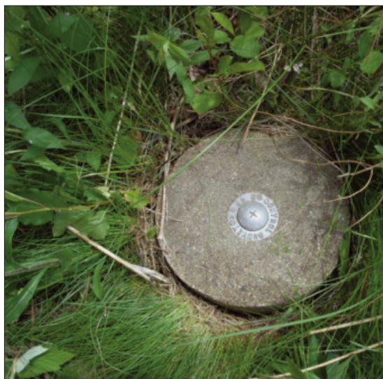
Figure 1: Geodetic control monument.

Geodesists assign coordinates to features on the Earth's surface that reflect the geometric and physical models that relate them. These features are commonly referred to as geodetic control points or geodetic control monuments, as they "control" or underpin the position of other features for which coordinates are derived. By measuring from these control monuments using surveying instruments, position can be determined. Figure 1 illustrates a traditional geodetic control monument constructed with concrete, rebar and a brass marker.