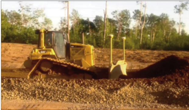
Figure 3: Bulldozer leveraging GNSS NRTK for achieving finished grade in Antigonish, Nova Scotia.